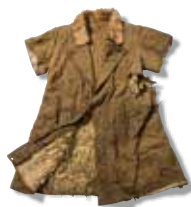
Sleeveless Padded Overcoat (the sleeves were exchanged for black rye bread)

The displays in this zone show includes a model of a gulag, or Soviet forced labor camp, as well as tools used in forced labor, handmade eating utensils, and pictures drawn by those who experienced gulag life.