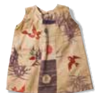
Child's Dress Made from the Diapers of a Baby Who Died

The displays in this zone show documents issued at the time of repatriation, a model of the repatriation ship, and photographs of children.