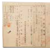
Certificate of Repatriation