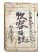
Diary of Confinement