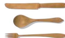
Handmade White Birch Eating Utensils