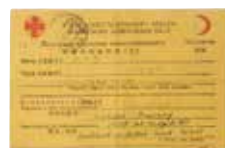
Prisoner-of-War Post Card