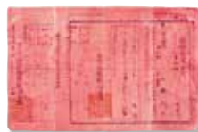
Draft Order Known as Akagami, or Red Paper

The displays in this zone show a draft order, military uniforms, diaries, letters, and other items that communicate the hardships of the soldiers.