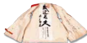
Waistcoat with Prayer for Protection against Bullets